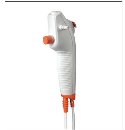
The ergonomic and lightweight handle is designed to give you a firm and comfortable grip