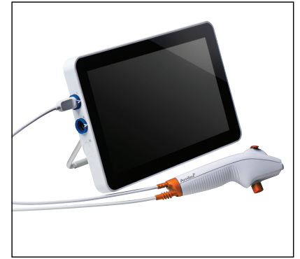
Ambu aScope 4 Broncho Large and Ambu aView 2 Advance