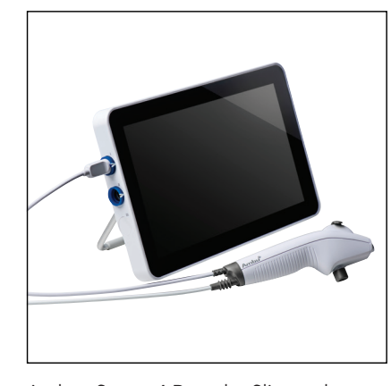
Ambu aScope 4 Broncho Slim and Ambu aView 2 Advance