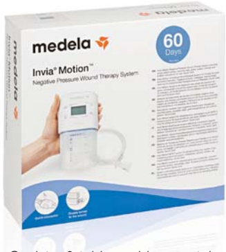
Canister & tubing sold separately.

The Invia Motion – 60 Days delivers the convenience of a personal, single-patient-use pump while offering clinical flexibility with a choice of pressure settings, therapy modes and compatibility with both foam and gauze dressings. The Invia Motion - 60 Days is appropriate for use when 60 days life use is needed. The compact design and quiet operation helps patients to comfortably go about daily activities for the duration of therapy.